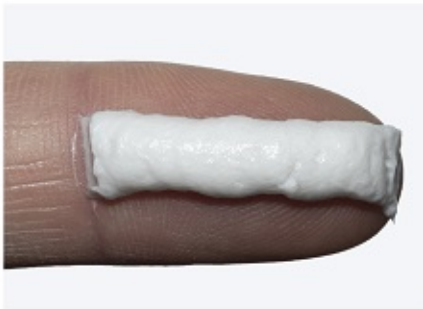
Number of fingertip units to use